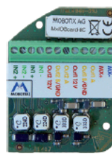
MxIOBoard-IC for signal input/output (accessories)